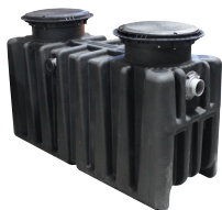
NEW Endura® XL 150 Units